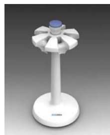
Carousel Pipettor Stand

Tip ejector allows ..... convenient one-handed operation