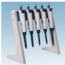
Linear Pipettor Stand